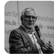
Jochen Flasbarth BMU German Federal Ministry State Secretary